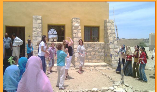
F79-Seif El Nasr, Fayoum, 2010

traveled to see the pyramids. Other projects included fruits molded from clay, paper flowers, and a doll with a fashionable outfit made from a potato chip bag, which shows that nothing goes to waste, and anything can be transformed into something.