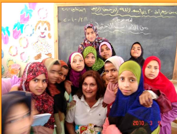
M27-Maghraby, Minya, 2010

Yes, school visiting days are always good days. Kym Fish