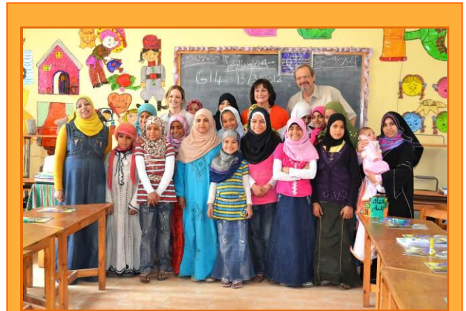
G14- El Belieda, Giza, 2012

Imaginative creativity in the girls' schools is abundant, and this was exemplified on a three-day trip to the Minya area in the spring of 2010. Tours of the classrooms showed the corners to be filled with projects, created with skilled little hands. The Great Pyramids, a common theme, were constructed with accuracy, incredible since the girls had never