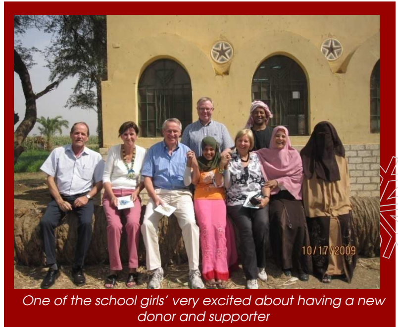
One of the school girls' very excited about having a new donor and supporter

Not only the work included maintenance for the school building, but also they added a fence and a garden to the school. They also donated two desktops and some other furniture units for the school.