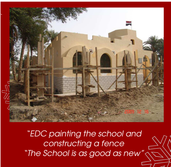
"EDC painting the school and constructing a fence "The School is as good as new"

EDC is an excellent donor, their support to the school is outstanding, and Apache will always be committed to help and guide any similar support to Springboards' project.