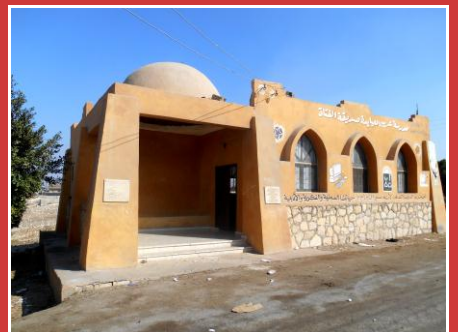
G31 - Abou Kilani